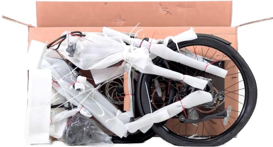
Figure 2: Saddle and separate box with: saddle, fender, pedals, charger, and toolkit.

Figure 1: Bike frame, bike box, saddle, additional box of parts (Figure 2), front wheel, axle skewer, stem and handlebars, all zip tied together and padded.