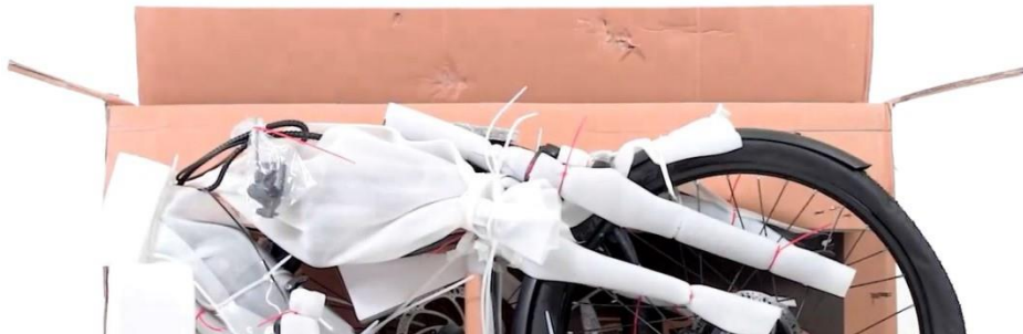
Figure 1: Bike frame, bike box, saddle, additional box of parts (Figure 2), front wheel, axle skewer, stem and handlebars, all zip tied together and padded.