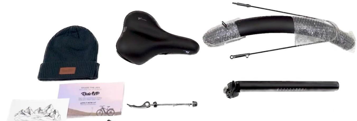
Figure 2: Saddle and separate box with: saddle, fender, pedals, charger, and toolkit.